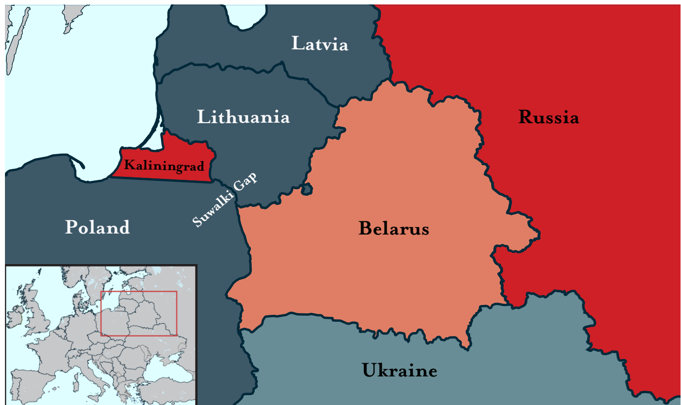
Figure 1. The Suwalki Gap along the Poland-Lithuania border.

Should Moscow acquire the ability to deploy its own ground forces in northwestern Belarus—around Grodno, say—it would be able to threaten the Suwalki GLOC credibly without putting Kaliningrad at risk. Such a deployment would be likely to increase substantially the risk to NATO's ability to keep significant forces in the Baltic states